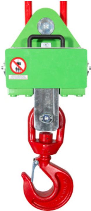
MCWHU: view of the back.