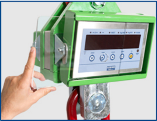
Protective screen in plexiglas for display and keyboard.