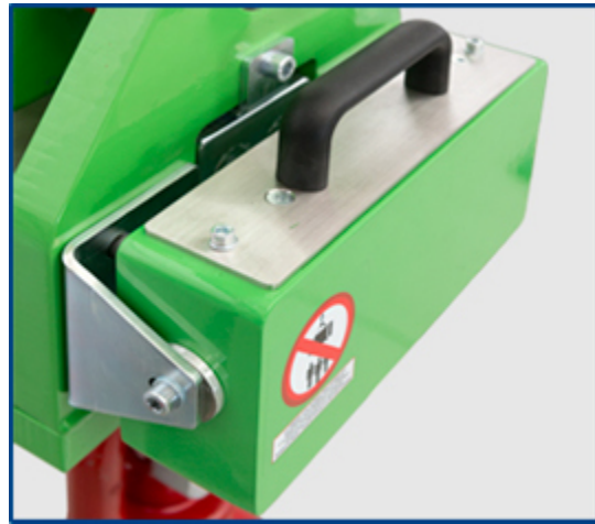
Fitted with extractable rechargeable battery pack.