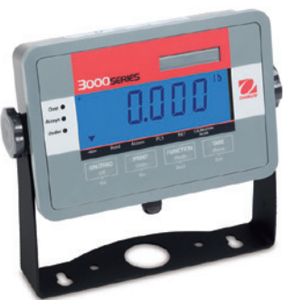
T32MC (LCD version)