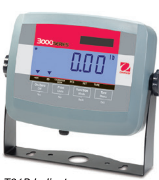
T31P Indicator shown with optional bracket